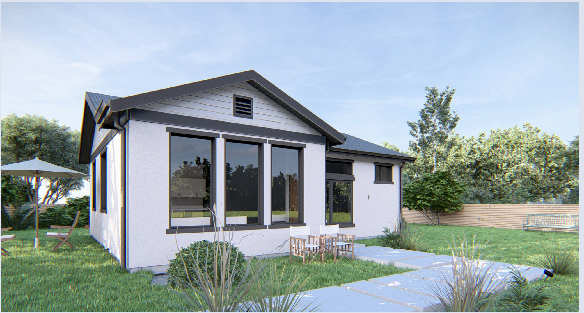
LEFT ISOMETRIC ELEVATION