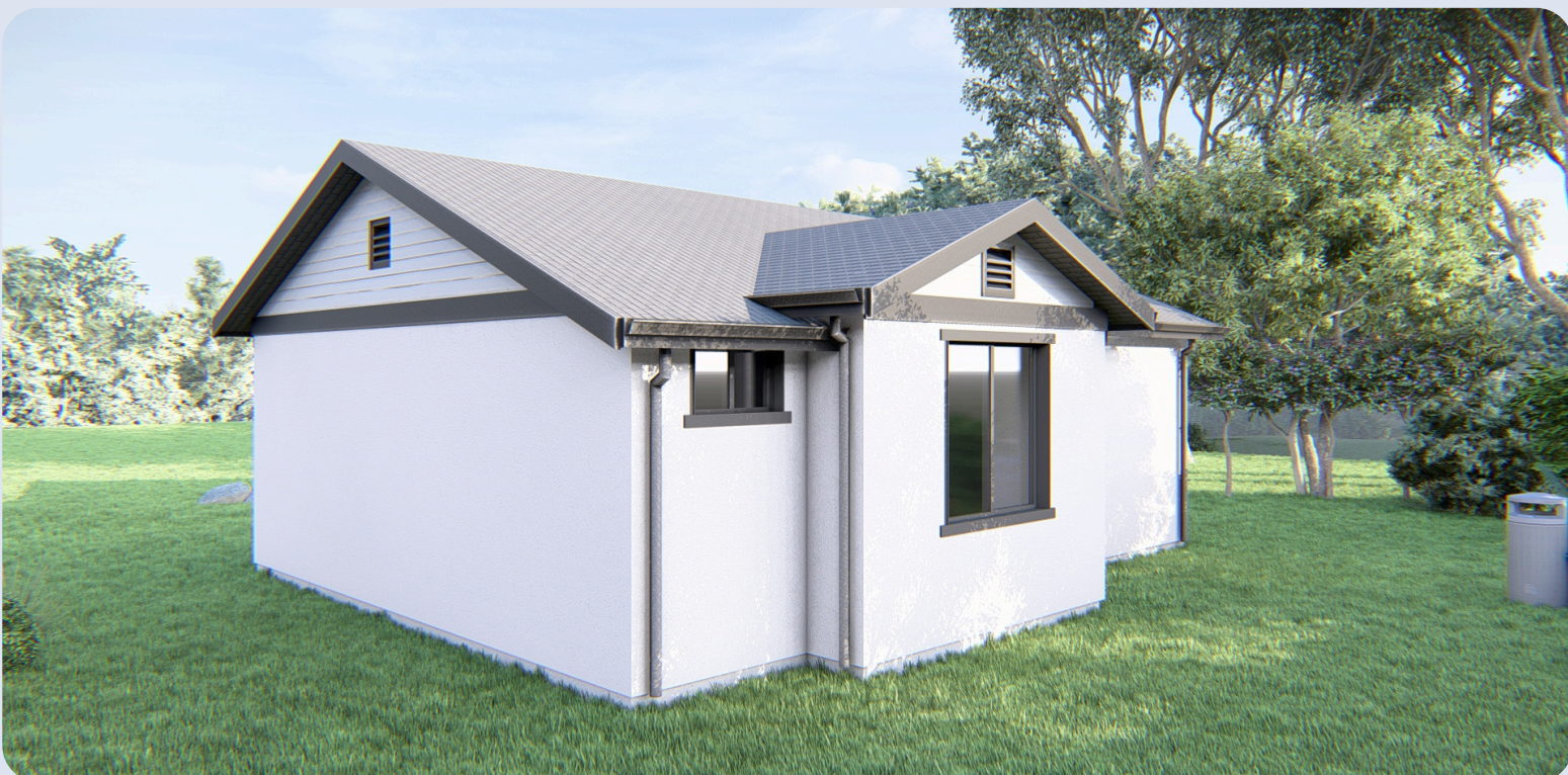
RIGHT ISOMETRIC ELEVATION