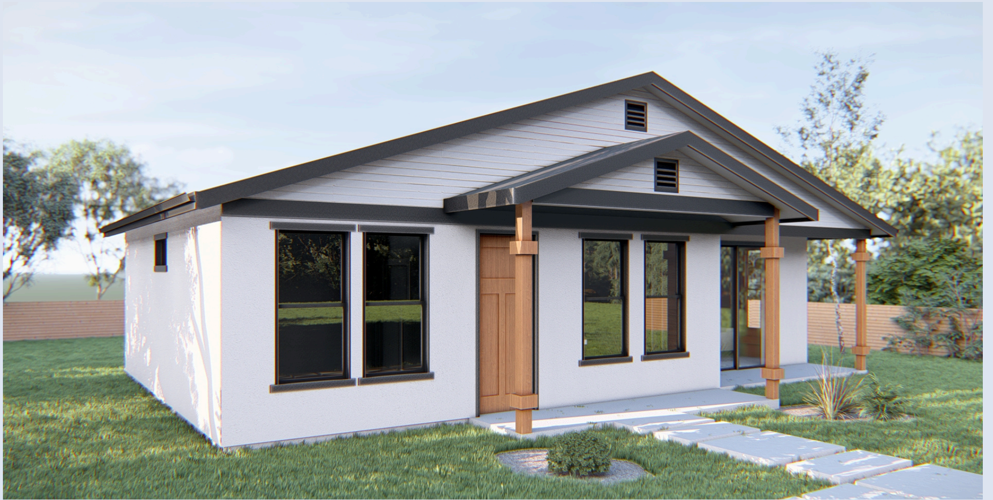
LEFT ISOMETRIC ELEVATION