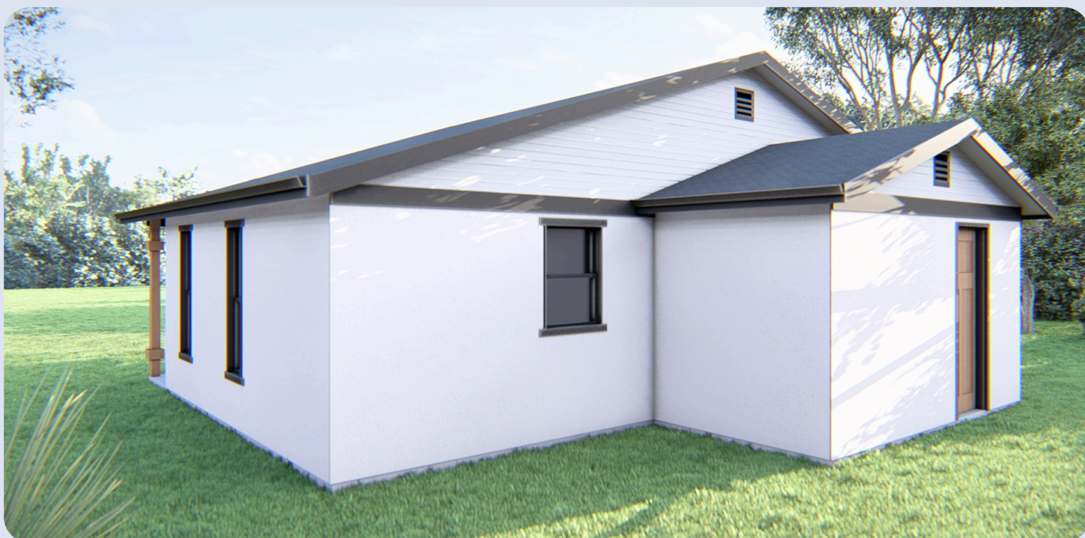
RIGHT ISOMETRIC ELEVATION