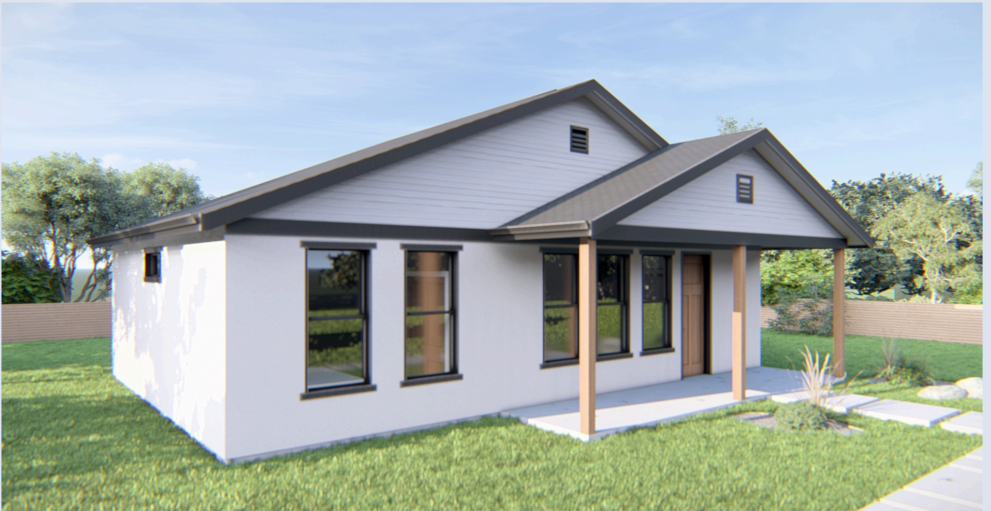
LEFT ISOMETRIC ELEVATION