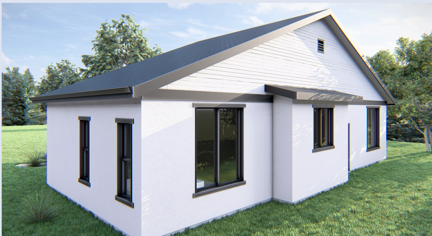
RIGHT ISOMETRIC ELEVATION