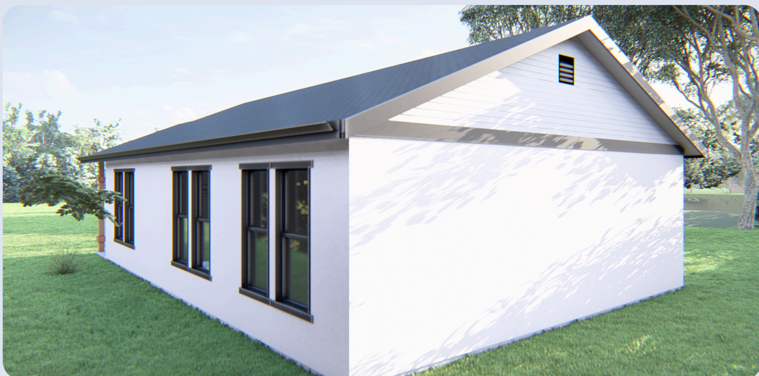
RIGHT ISOMETRIC ELEVATION