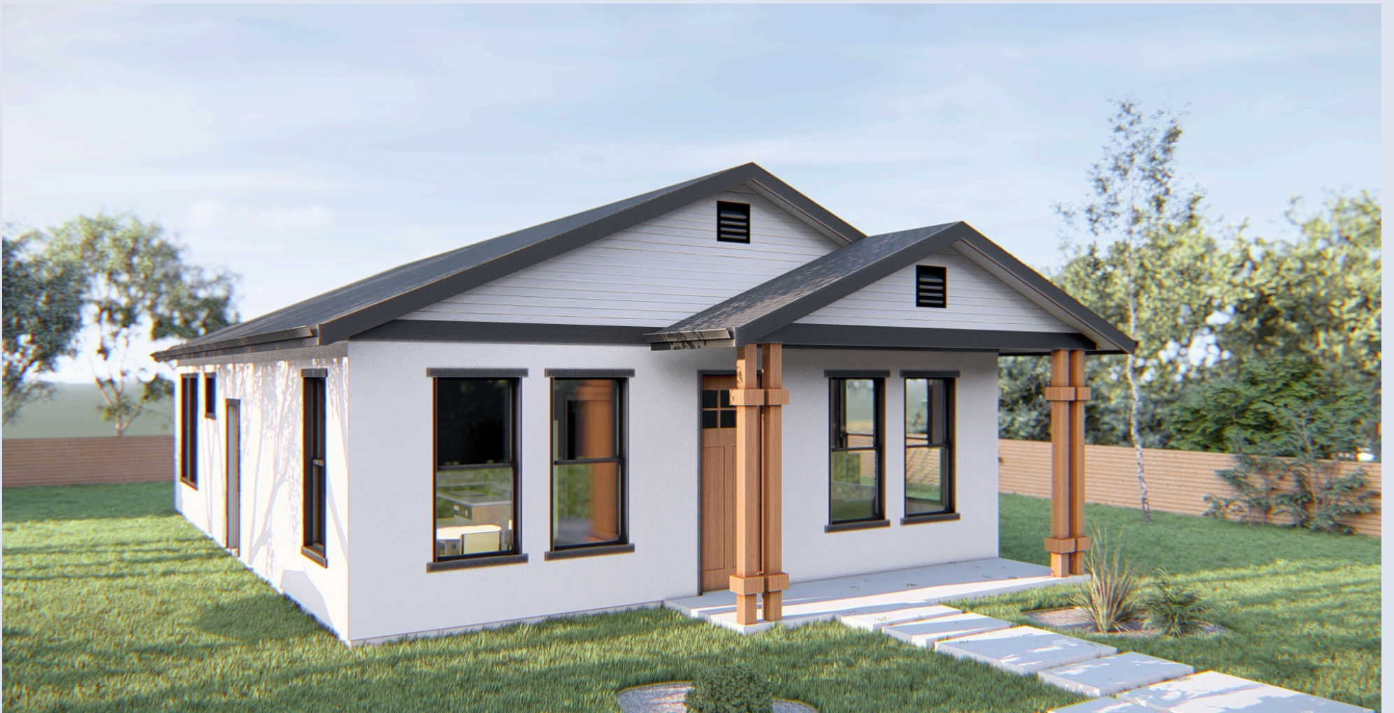
LEFT ISOMETRIC ELEVATION