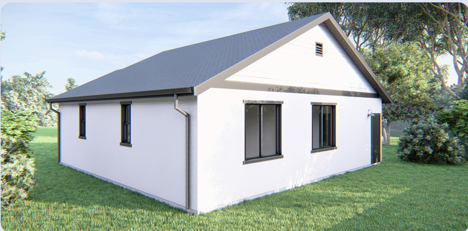
RIGHT ISOMETRIC ELEVATION