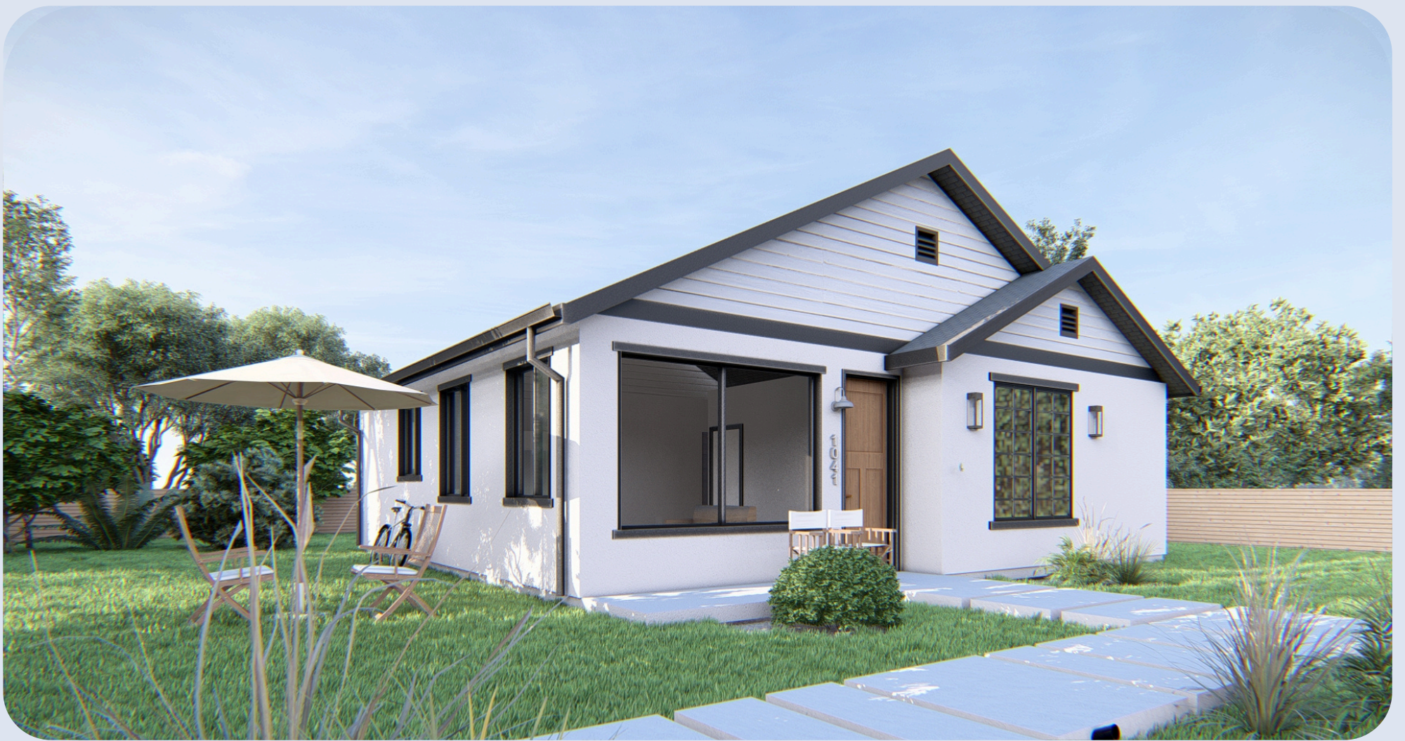
LEFT ISOMETRIC ELEVATION