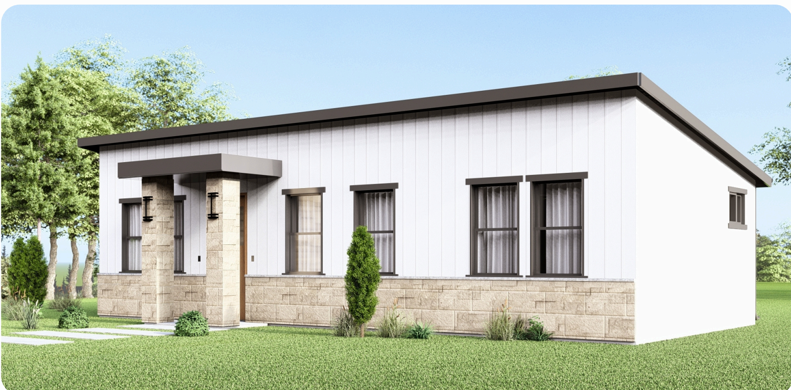
RIGHT ISOMETRIC ELEVATION